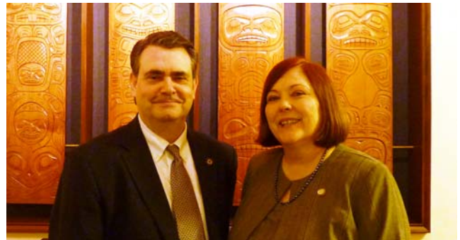
Senator Ellis and Representative Gardner in the halls of the Capitol Building during the first week of the 2011 legislative Session.